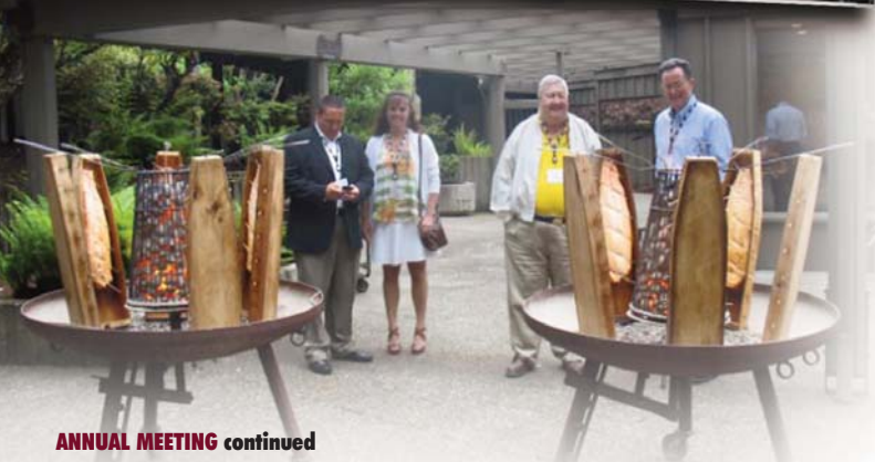
ANNUAL MEETING continued

The OTA truly appreciates the support of its generous members who helped sponsor this year's event!